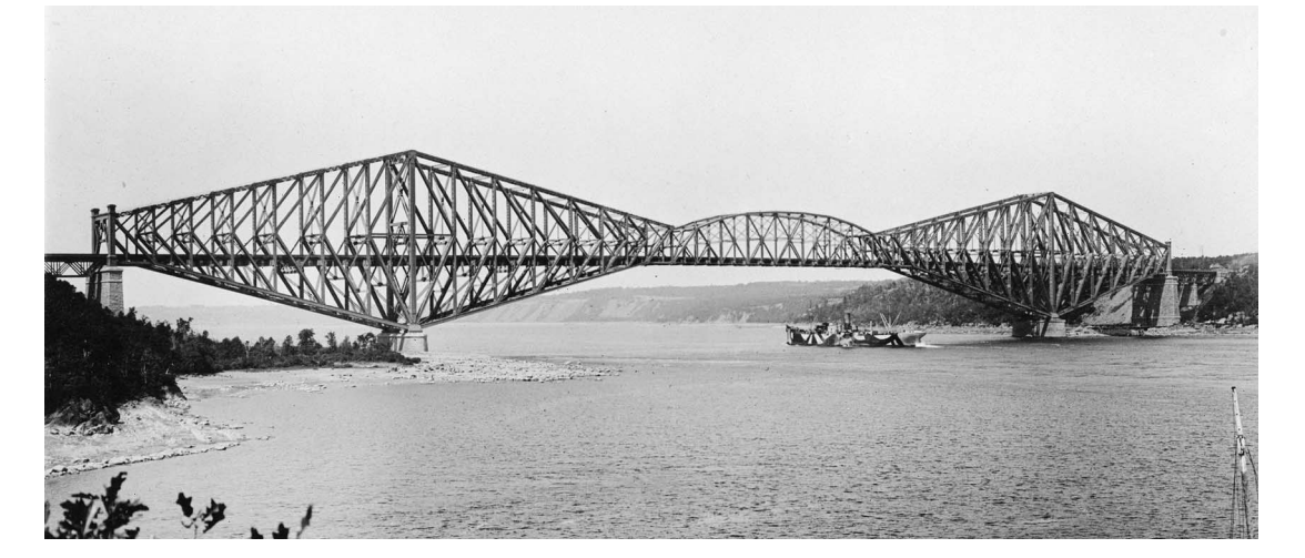
Fig. 2. Québec Bridge, Quebec, constructed 1911–1917. The world's longest span cantilever bridge with a 1800 ft (549 m) main span.

introduction of new structural materials, which resulted in his long-span bridges being state-of-the-art structures of their type. In July 1939, Pratley received a D.Eng. degree from his alma mater , the University of Liverpool, an achievement very rare among practising engineers; more common among engineers in the academic field (Anonymous 1939).