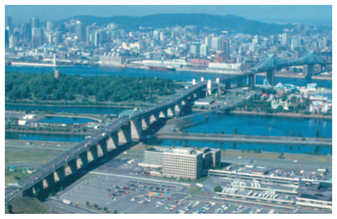
Fig. 8. Raised Seaway section, constructed 1957–1958, of the Jacques Cartier Bridge. At the time, the largest jacking operation anywhere in the world (photo taken August 1991; courtesy of Centre de documentation, Ministère des Transports du Québec, d27465).

depth, weighing 180 tons each. They were of a record size for a Canadian bridge and among the largest prestressed concrete beams in North American bridge construction to that date. When completed, the entire Champlain Bridge project cost CAN$35 million (Anonymous 1961 a , 1961 b ; pp. 15–21 of Martineau 1963).<sup>24</sup>