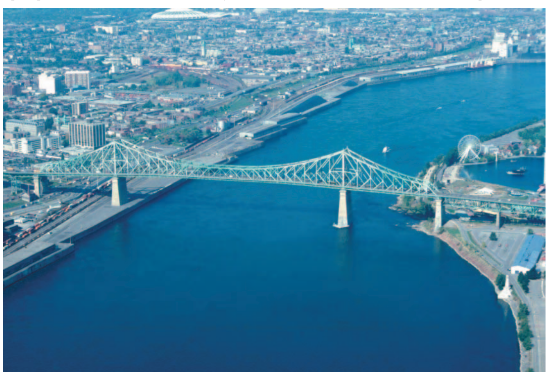
Fig. 3. Jacques Cartier Bridge, Montréal, constructed 1925–1930. When built, the fifth-longest span cantilever bridge in the world with a 1097 ft (334 m) main span (photo taken in October 2000).

fabricated, prestressed, measured, and socketed in the United States by the John A. Roebling & Sons Company of Trenton, New Jersey, which had but recently developed the prestressing process (Steinman 1929; Durkee 1966).<sup>13</sup>