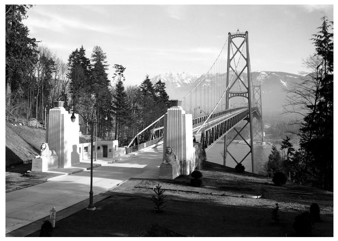
Fig. 5. View looking towards Lions' Gate Bridge, Vancouver, constructed 1937–1938. When erected, the longest-span suspension bridge outside of the United States with a 1550 ft (472 m) main span (photo by Leonard Frank, "View looking Towards Lions' Gate Bridge", March 1939; courtesy of Vancouver Public Library, VPL 3036).

neer, and was responsible for designing and supervising the construction of a variety of long-span highway bridges, including several additional landmark structures, such as the following.