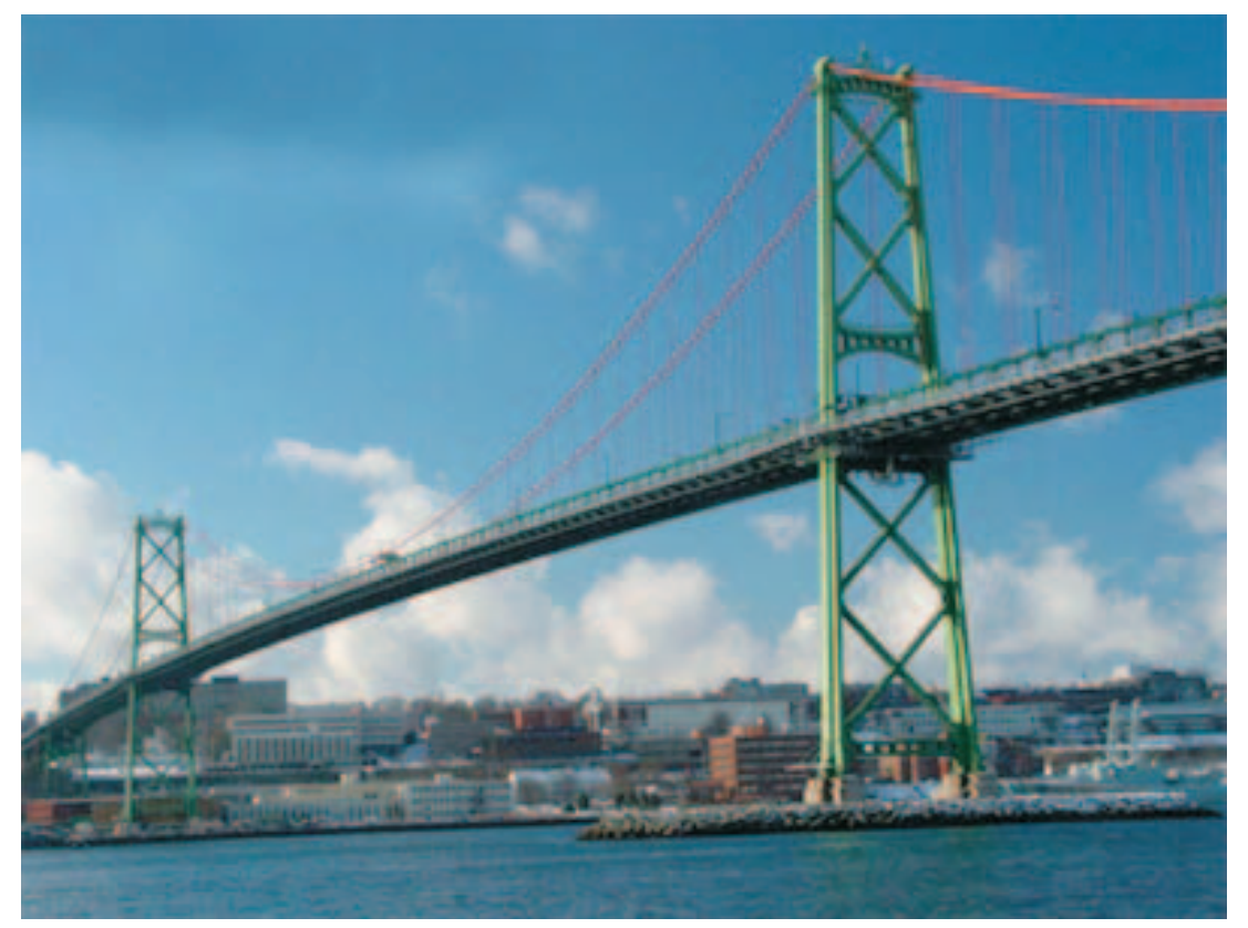
Fig. 6. Angus L. Macdonald Bridge, Halifax, constructed 1952–1955. When erected, the second longest span bridge in the world outside of the United States with a 1447 ft (448 m) main span (photo taken in 2000).

rence River at Montréal (see pp. 36-38, Passfield 2003) (Fig. 8). This CAN$7 million project, the largest jacking operation in the world to that date, required the raising of 16 spans on the southern approach of the existing bridge to provide a 120 ft vertical clearance for the approach span directly over the new Seaway channel. In a highly synchronized jacking operation, employing specially designed 400 and 500 ton (1 ton = 0.907 t) jacks, pumps, and an hydraulic control system, the spans were raised in sequence in a series of 6 in. (1 in. = 25.4 mm) lifts over an extended period of time, so as to avoid any unacceptable interim grades or deck discrepancies that would disrupt the heavy traffic on the major highway artery entering the city from the south shore. During the entire jacking operation, highway traffic on the bridge was interrupted only periodically, between 0100 and 0500 in the morning, for the jacking operations; and for 4 hours on a single Sunday morning to replace the deck truss span over the Seaway channel with a through-truss span to attain the final 30 ft of the requisite vertical clearance (Chamberlain 1958; Anonymous 1958a).